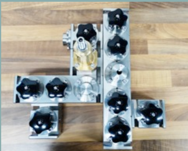
Hydrogen Filling system 1000 bars